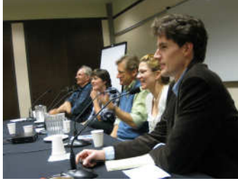
November 2009 Future of Bodywork Panel